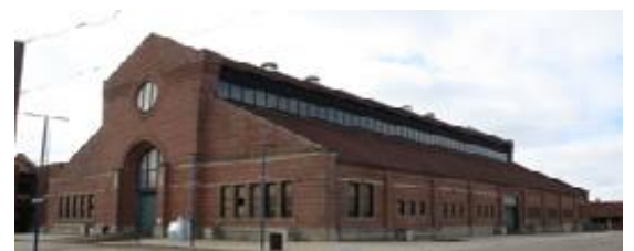
100'x150' open arena for tack sale, riding and driving