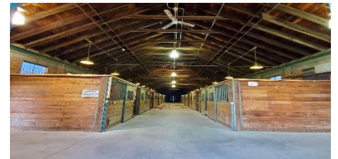
10 x 10 Permanent Stalls, Clay Floor

Thursday - Free Education Seminars, sponsored by the Clydesdale Education Foundation