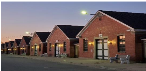
Historical Barns with Concrete Aisles

Tentative Schedule of Events – Updates to the schedule will be posted on website at www.clydesusa.com